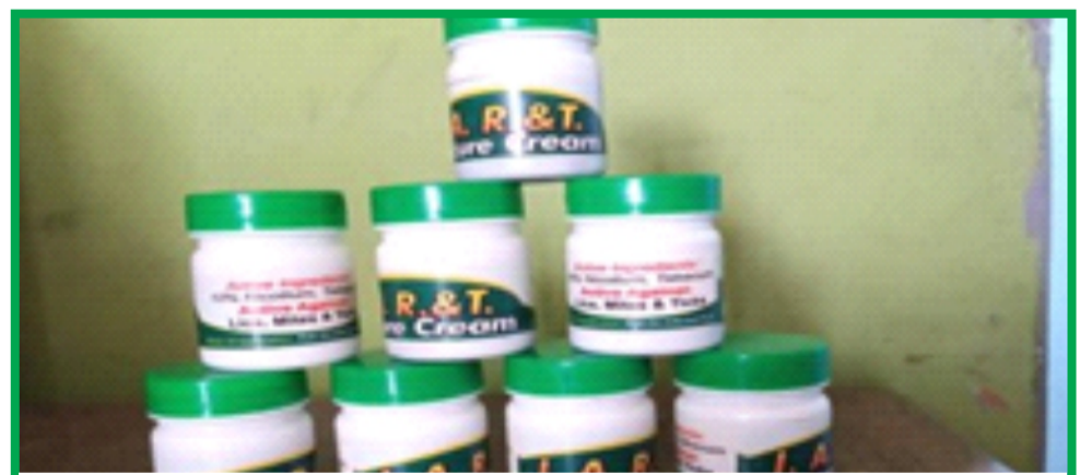
Figure 6: IAR&T Ectocure cream for small ruminants, swine, rabbits, grasscutters

The Programme has also been able to develop an ecto-parasitic cream named 'Ectocure' which can be used for the cure of ecto-parasitic infection in small and large ruminant, swine, rabbits and grasscutters.