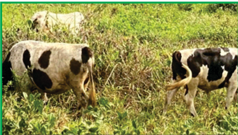
Figure 3: Muturu Cattles acquired from the TETFund Grant

The Programme is also currently executing the National Research Fund Grant titled 'The Genetic Improvement of Muturu Breed of Cattle for Increased Carcass Yield and Productivity' awarded in 2025 by the Tertiary Education Trustfund (TETFund), Nigeria.