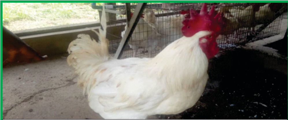
Figure 1: Grand Parent Stock of MoorBeta Chicken

cooking loss. In appearance, it is predominantly white with speckles of brown, black, or red, features a large single comb, and has a well-developed body that supports higher meat yield. It also demonstrates tolerance to heat stress, making it well suited for poultry production in tropical climates. A 2025 partial cost analysis indicates that raising 100 of our birds can generate a net profit exceeding N278,000 within a 10-week production cycle, indicating strong economic viability and a compelling return on investment for both smallholder farmers and commercial operators. The release of MoorBeta supports the key mandate of the Programme to improve local livestock breeds, increase productivity, and strengthen food and nutrition security.