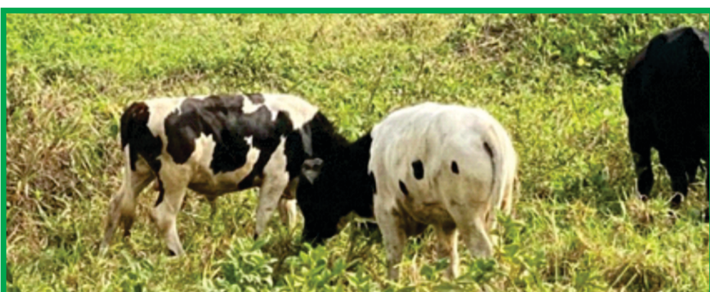
Figure 4: Muturu Cattles acquired from the TETFund Grant