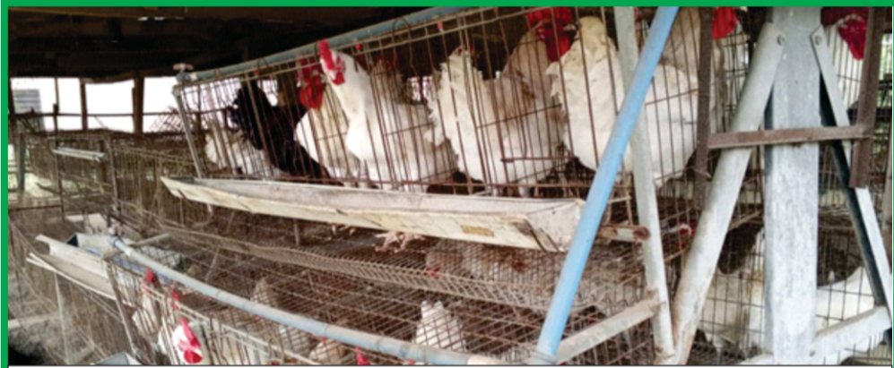
Figure 2: Parent Stock of the MoorBeta Chicken