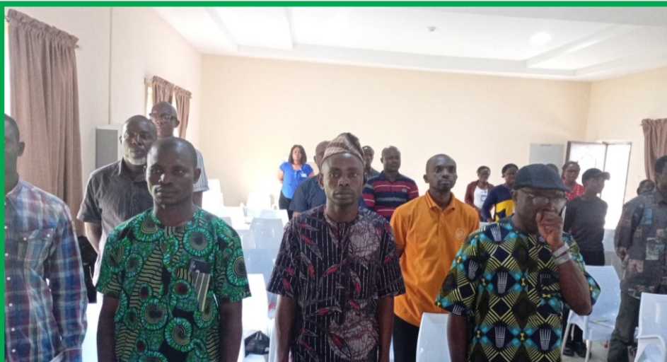
Cross Section Participants during the Opening Ceremony of the Workshop