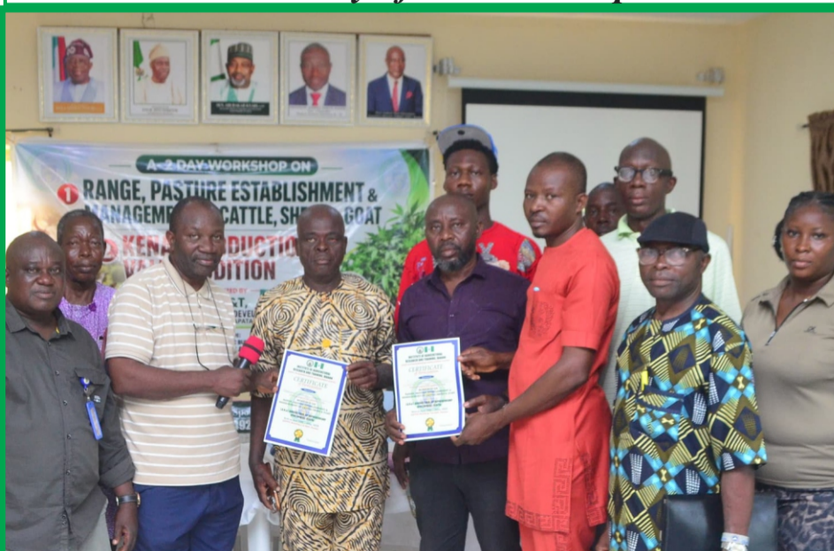
Presentation of Certificates to participants after the conclusion of the Workshop

The Institute of Agricultural Research and Training (IAR&T), Ibadan, through its Entrepreneurship Centre, organized a 2-Day Workshop on Range, Pasture Establishment & Management of Cattle, Sheep & Goats and Kenaf Production, as well as Value Addition, held at the AVAEC Building of the Institute between 29th and 30th April, 2026.