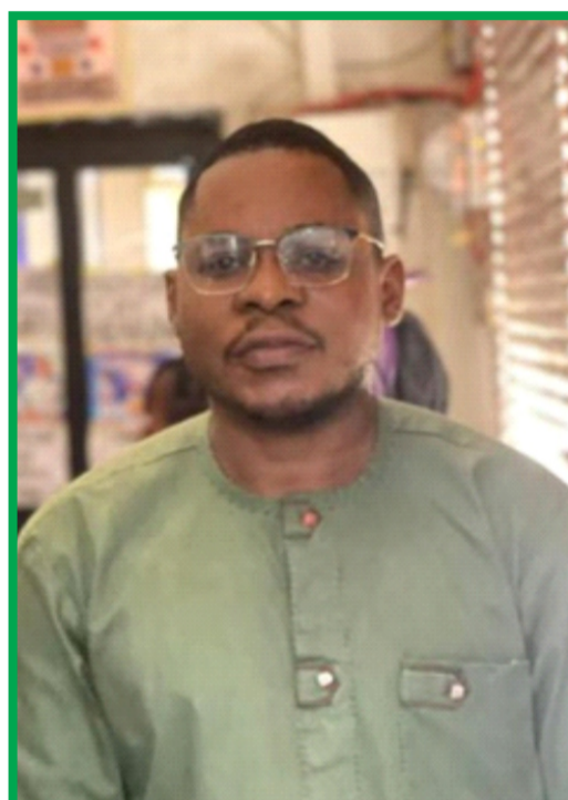
Newly Appointed Seed Officer of the Institute