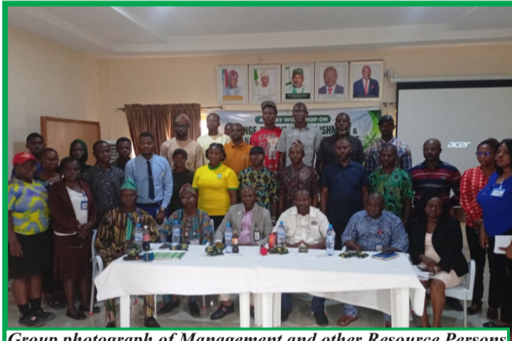
Group photograph of Management and other Resource Persons with the participants after the Opening Ceremony