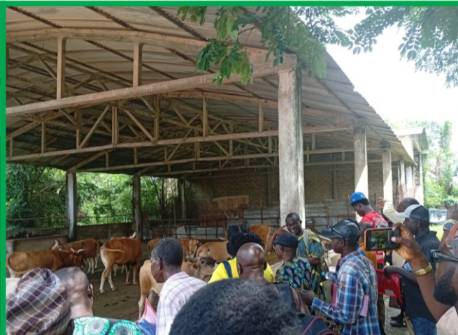
Participants on field training during the Workshop